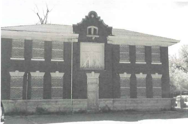
The 1914 pump house and former sawmill in Concordia Cemetery. The windows were bricked over in the 1960s because of vandalism.

publications name the town and sometimes a nearby intersection for buildings but usually do not give an exact address, making positive identification difficult. Two other buildings in the area that we can attribute to Duesing, though, are the 1910 Emil and Martha Freitag Flats in Oak Park, and a building in Concordia Cemetery, Forest Park, built in 1914. The Freitag Flats is a two-story two-flat building on South Clarence Avenue that is reminiscent of both the Stege House and the parsonage at Zion German Lutheran Church. The building at Concordia Cemetery originally housed a saw mill and water pumping facility on the first floor with warehousing on the second. This building still serves as the pump house for the cemetery's well water supply.