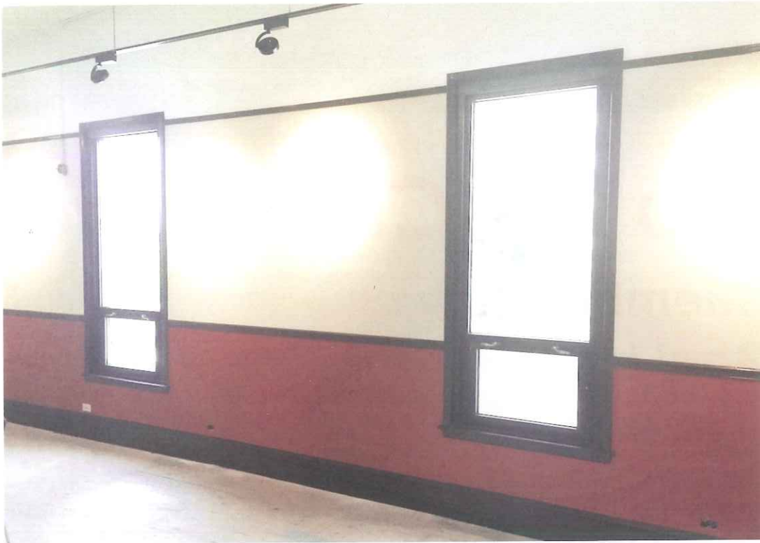
(left) The second floor walls are painted in colors and style popular at the turn of the 20th century.