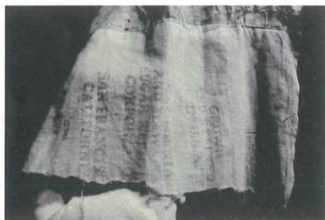
Detail of the added fabric showing the faded sugar company printing

With this information, I reasoned the dress would date to 1906 or later, but looking at it on the mannequin, it was more typical of the late 1890's. Now even more confused, I reexamined the printing with a magnifying glass and, remarkably, found a copyright mark dated 1934. With that detail, the dress made sense!