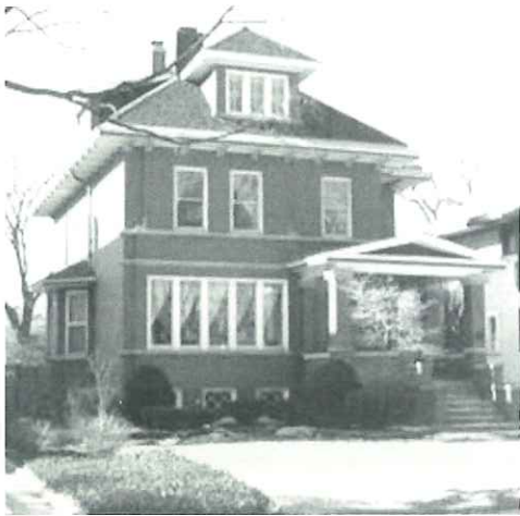
The Edward and Emma Stege House

Occasionally, though, we are able to rediscover one of these forgotten architects. Such was the case while researching the Edward and Emma Stege House on South Elmwood Avenue for the Historical Society's 2016 Spring Housewalk. Built in 1916, the red brick Stege House appears at first glance to be stolid, unremarkable, and almost fortress-like. But the somewhat plain exterior hides a beautifully planned interior with magnificent wood and plaster work and a surprising level of natural light. It is a sturdy house with a heavily reinforced foundation and transverse steel beams supporting the floors; a home built to last and built to impress from the inside rather than from the street.