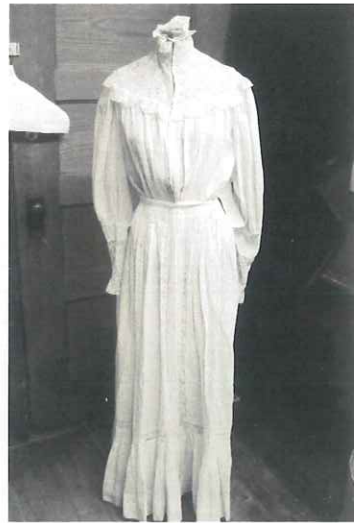
This classic late Victorian blouse and skirt presented an unusual puzzle.