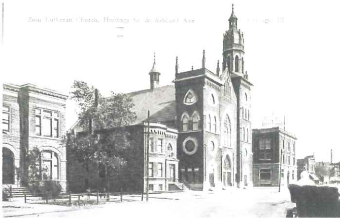
Zion German Lutheran Church and Parsonage, Ashland Ave. & Hastings St., Chicago, as seen on a postcard, c. 1910.