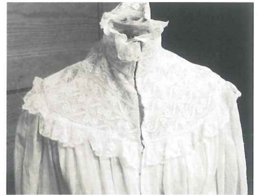
The delicate, precise detailing of the blouse (above) is at odds with the rather crude addition to its bottom (below)

On closer inspection, I realized there was faded printing on the back of the additional fabric. I could just make out the words “California and Hawaiian Sugar Refining Corporation, San Francisco, California”. Not one to ignore a clue, I did a little research, and discovered this company had been founded in 1906. Still in business, it is well known today as C&H Sugar.