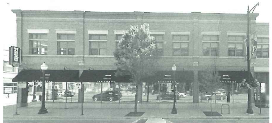
The F. W. Zuttermeister Department Store Building

In 1905, he designed Zion German Lutheran Church and the adjoining parsonage at the corner of Ashland and Hastings St. in Chicago. While the building is still there, it is, unfortunately, in rather poor shape. The steeple, finials, and much of the cornice have been removed, the original doors are long gone, many of the windows have been bricked up or replaced, and much of the tracery is missing.