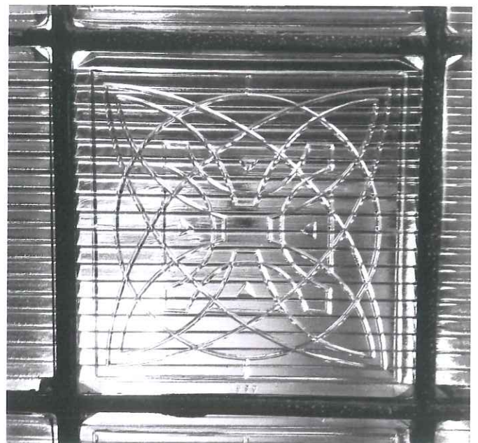
Frank Lloyd Wright designed and patented more than 40 different decorative tiles for the Luxfer Prism Co. in 1895, although only one design (above) was produced. According to the Frank Lloyd Wright Trust, royalties from his designs for Luxfer enabled Wright to add the studio to his Oak Park home in 1898.